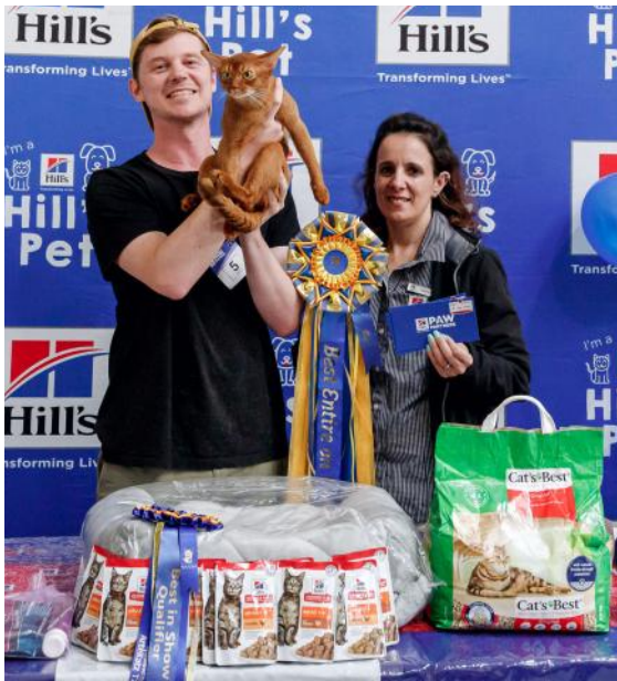
SUPERPOLLY MICKEY of ATLANTIC