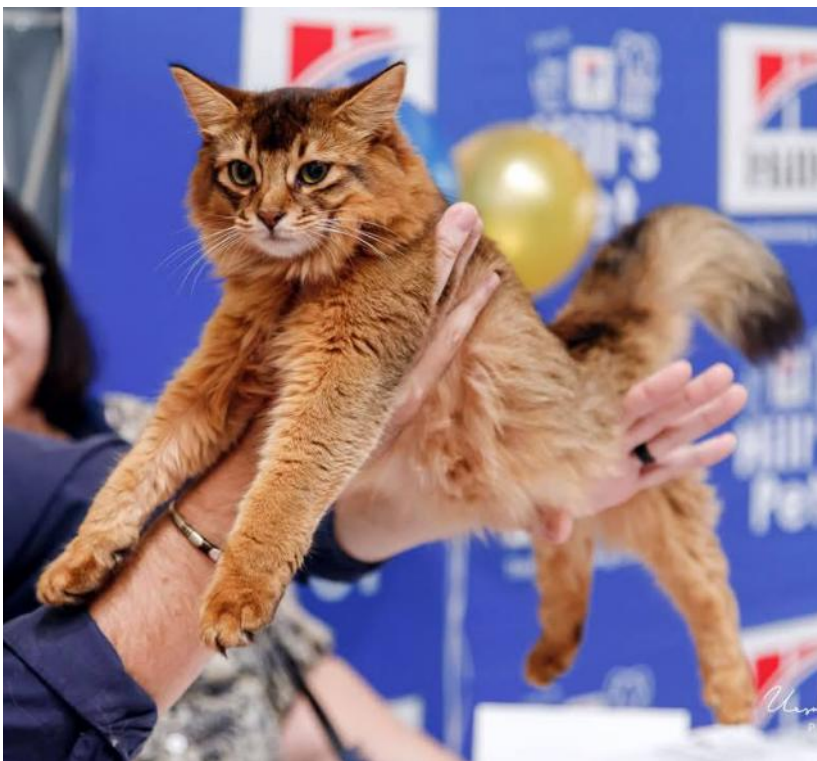
MAVERICK RED DRAGON.